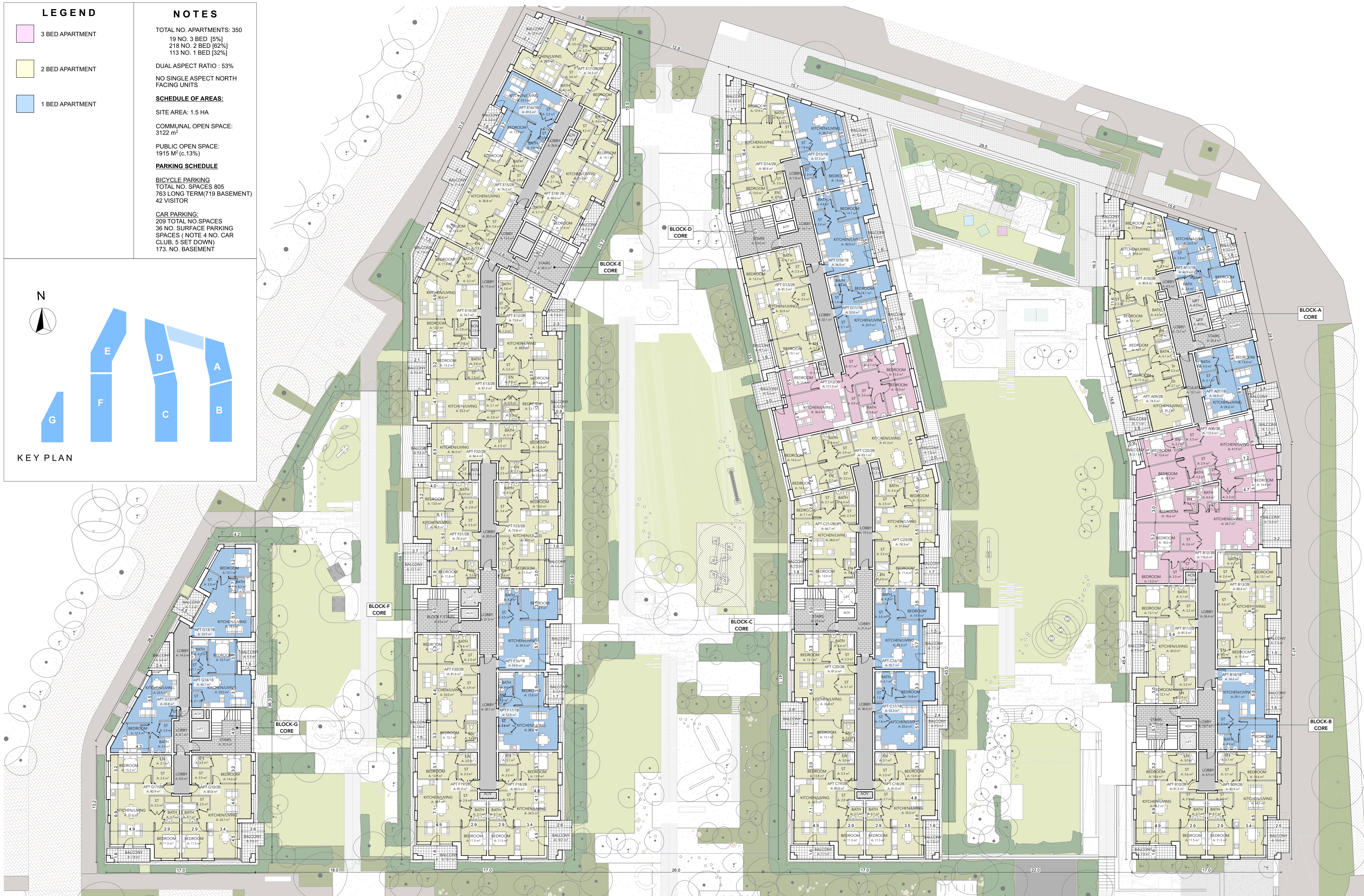
Second Floor Plan SCALE : 1:200